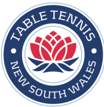
TABLE TENNIS NEW SOUTH WALES INC

Postal: PO Box 6952 Silverwater NSW 2128 Office Address: Quad 1, Level 2, 8 Parkview Drive, Sydney Olympic Park, NSW 2127 Office Phone: (02) 8736 1266 Office E-mail mail@ttnewsw.org.au Team Manager(s): juniors@ttnewsw.org.au Web site www.ttnewsw.com.au ABN 73 959 528 443