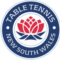
TABLE TENNIS NEW SOUTH WALES INC

Postal: PO Box 6952 Silverwater NSW 2128