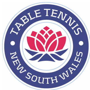
TABLE TENNIS NSW INC.