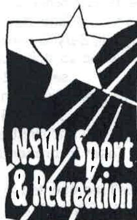
TABLE TENNIS NSW WISHES TO THANK NSW SPORT AND RECREATION FOR THEIR CONTINUING FINANCIAL SUPPORT

I think that my efforts in the office continue to provide an important link between Table Tennis NSW programs, NSW Sport & Recreation and the general public. With some changes to the way we do business there is no reason why Table Tennis can not grow and take advantage of the Olympics in Sydney. We may never have this opportunity again.