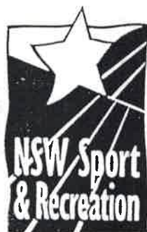
TABLE TENNIS NSW WISHES TO THANK NSW SPORT & RECREATION FOR THEIR CONTINUING SUPPORT.