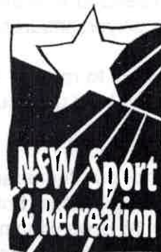
Table Tennis NSW is grateful for the encouragement and support provided by NSW Sport and Recreation