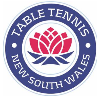
TABLE TENNIS NSW INC.