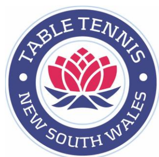
TABLE TENNIS NSW INC.