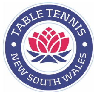
TABLE TENNIS NSW INC.