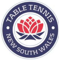
TABLE TENNIS NEW SOUTH WALES INC

Postal: PO Box 6952 Silverwater NSW 2128