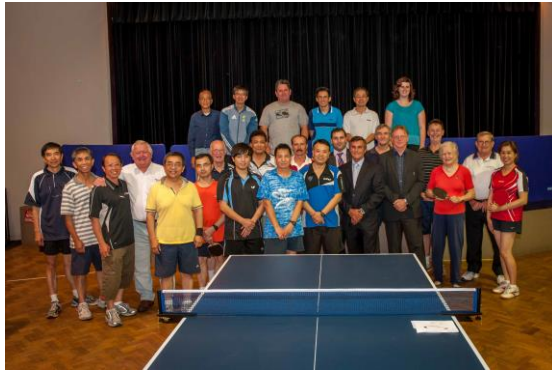
Photo of members at the Padstow R.S.L. Table Tennis

partnering the best or playing against the best. All do their best to become the No. 1 team on the night.