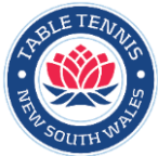
TABLE TENNIS NEW SOUTH WALES INC