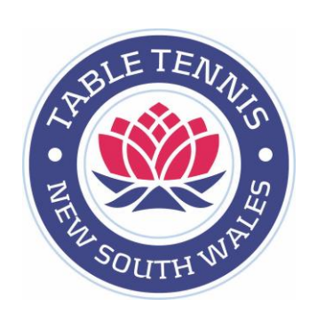
TABLE TENNIS NSW INC.